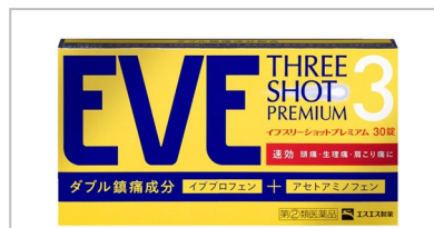
EVE THREE SHOT PREMIUM