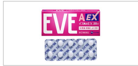
EVE A EX